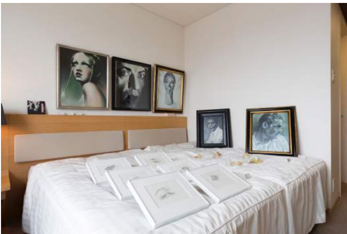
C.ART in PARK HOTEL TOKYO 2016 JIRO MIURA GALLERY