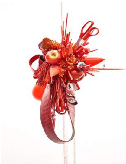
8. Yukari Araki 《Red》 Mixed media 2016 Courtesy of AIN SOPH DISPATCH