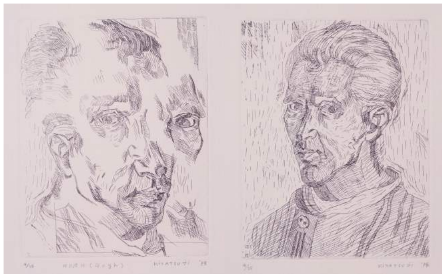
4. Yoshihisa Kitatsuji 《WORK (Gogh)》 Etching, arches paper 1978