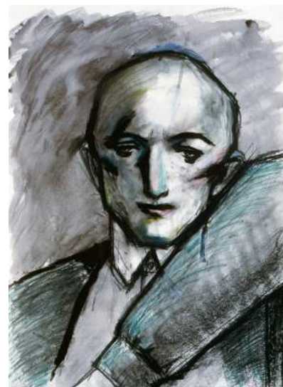
5. Katsura Funakoshi 《DR1015》 Ink, charcoal, color pencil, pastel and watercolor on paper 2009