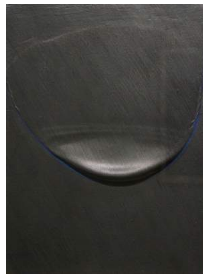
3. Takesada Matsutani 《WAVE90-4》 Vinyl adhesive, graphite pencil, acrylic and japeanese paper on canvas 1990