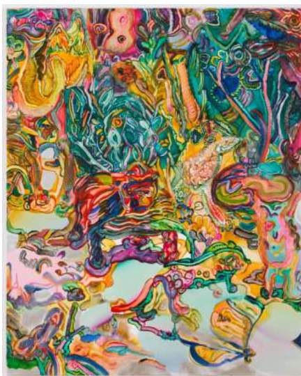
9. Tomoko Takagi 《Beppu 33》 Oil on canvas 2016