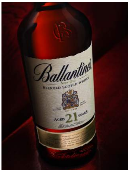
C. Ballantine's 21 Years Old

Date: 11th (Sat) - 12th (Sun) February 11:00am - 7:00pm (L.O. 6:30pm)