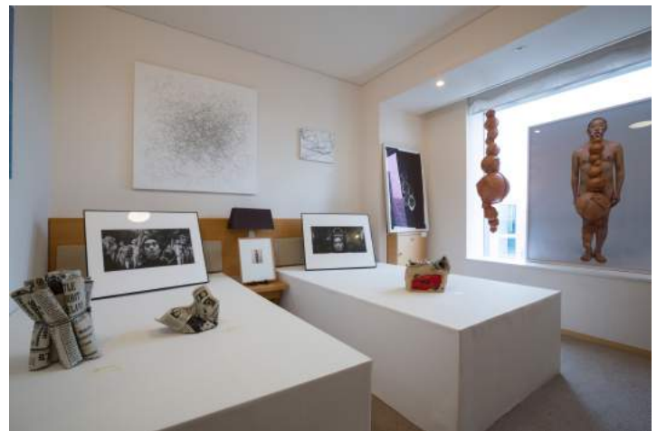
D. ART in PARK HOTEL TOKYO 2016 MEM