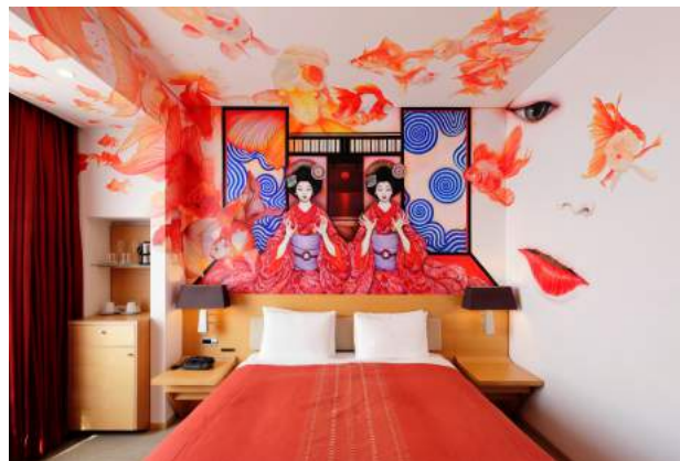
G. Artist Room Geisha Goldfish