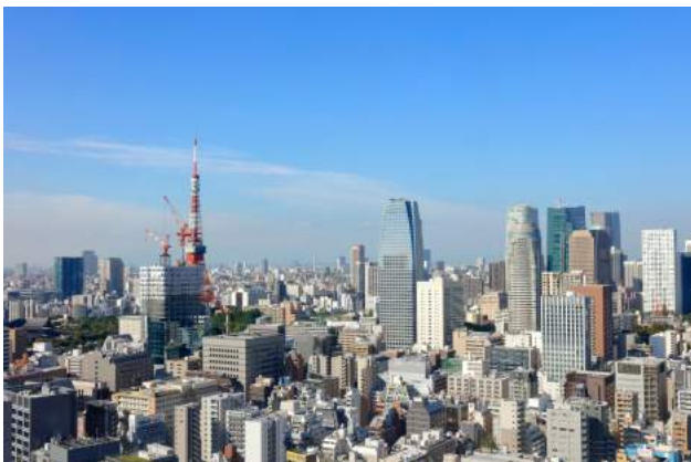
F. View from Park Hotel Tokyo

Hotel guests, who stays at Park Hotel Tokyo during the AiPHT fair period (March 8, Thu to March 10, Sat), will have free access to the fair.