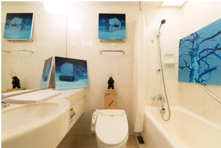
H. MORI YU Gallery, ART in PARK HOTEL TOKYO 2017