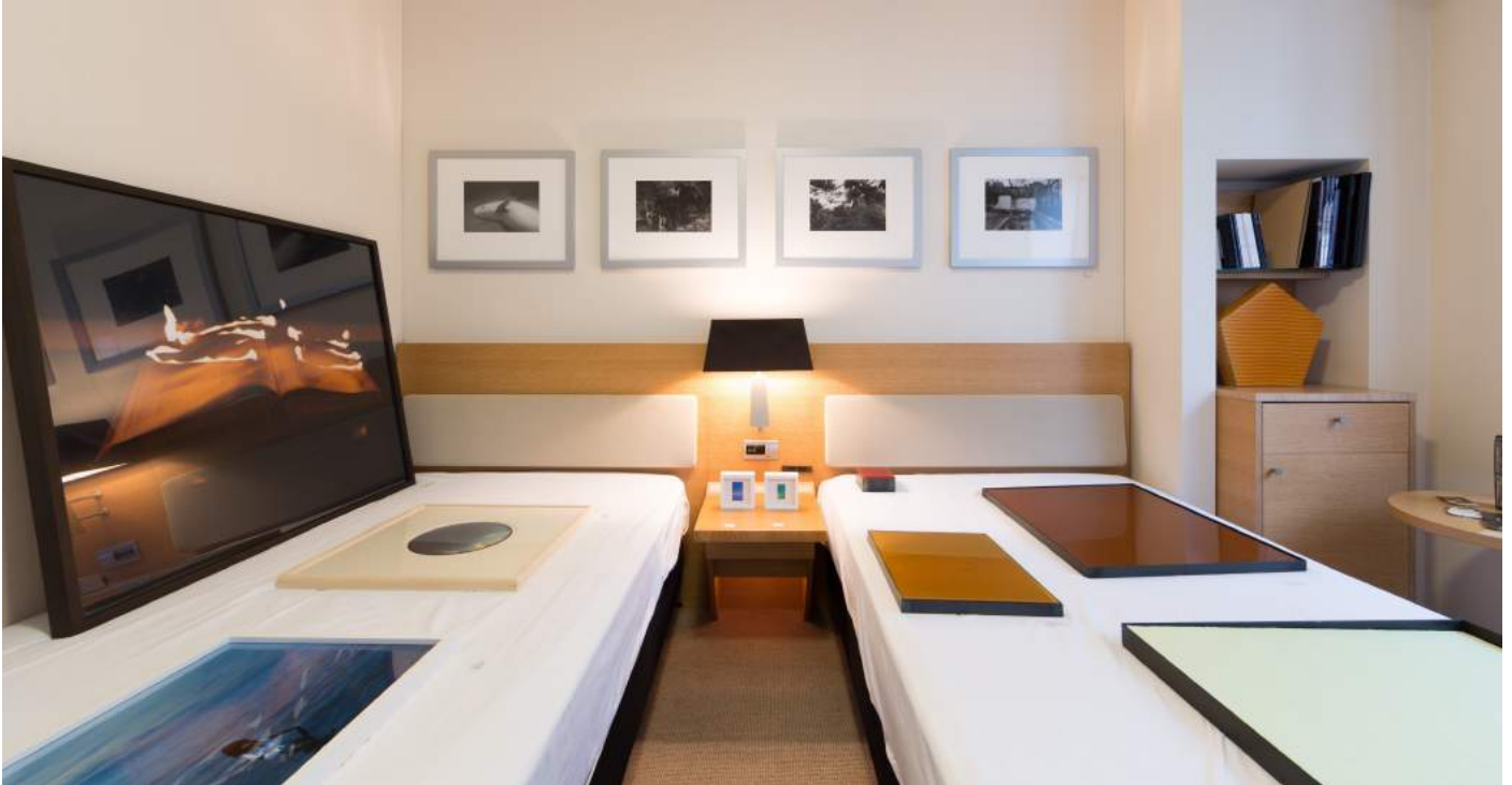
A. The Third Gallery Aya, ART in PARK HOTEL TOKYO 2017

Special event details, to make the fair more exciting, are now fixed!